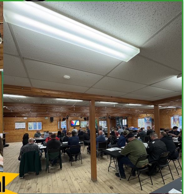
FSANL's 13th Annual Safety Conference