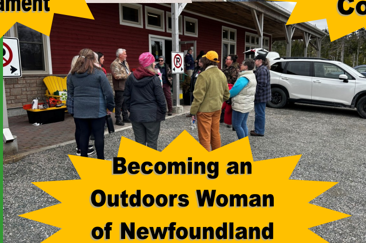
Becoming an Outdoors Woman of Newfoundland and Labrador