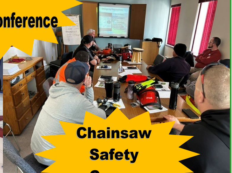
Chainsaw Safety Course