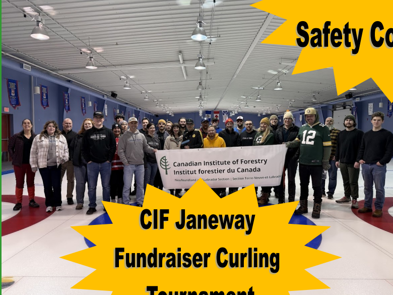
CIF Janeway Fundraiser Curling Tournament